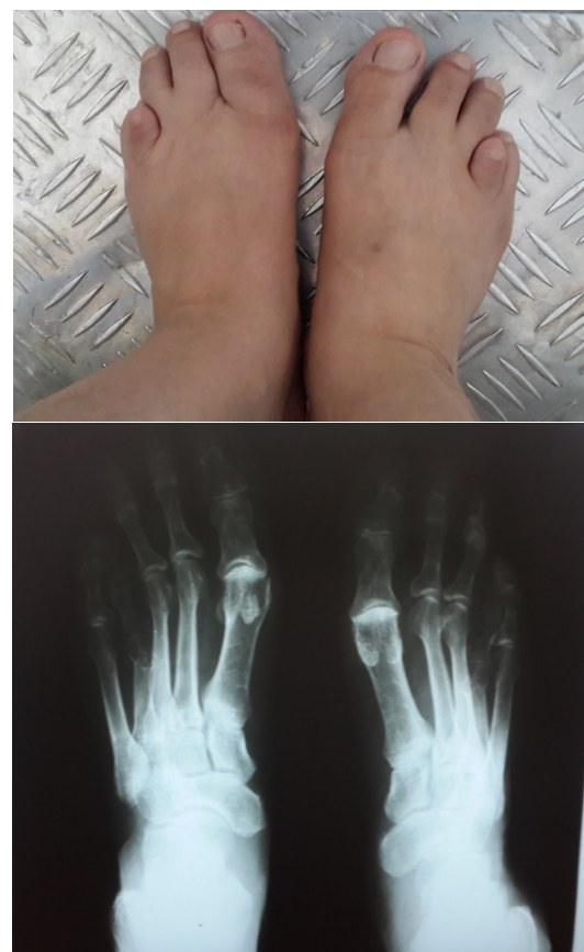
Figure 2. Radiography of her feet

normal and we ruled out Hyperaldosteronism, Cushing disease and Pheochromocytoma.