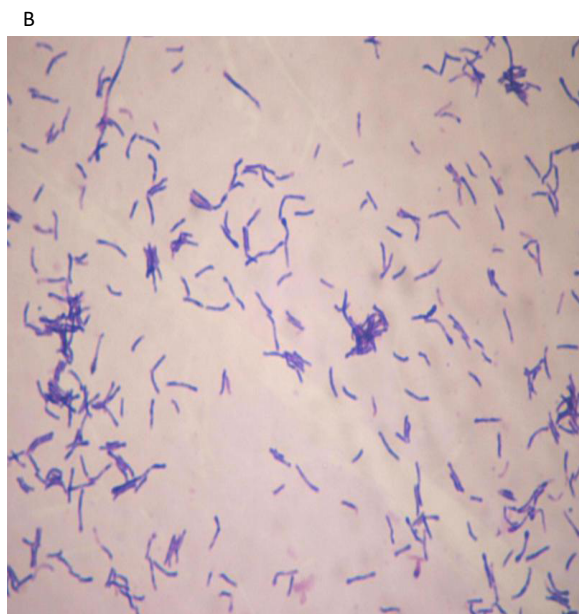
Figure 3. Two pictures of microscopic character of A. neuii

A: Gram Staining, and B: Methylene blue Staining.