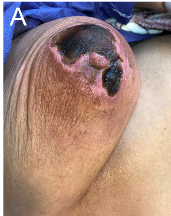
Panel A. Areolar necrotic ulcer with erythematous border

Although we could not confirm the diagnosis by pathologic exam but this mammogram with