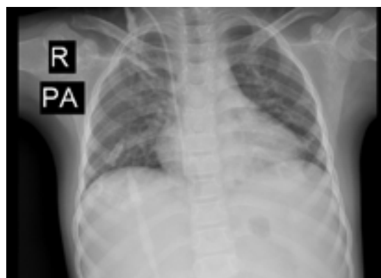
Figure 1. A mild nonspecific reticular pattern in chest X-ray

By worsening the patient's condition and her loss of consciousness, physicians performed craniotomy, and the extracted tissue was sent to an expert pathologist. The pathologist reported a neural tissue with multifocal neutrophils infiltration, necrosis, and hemorrhage with the presence of a few non-septic fungal hyphae. These findings were suggestive of mucormycosis. The patient was followed by anti-fungal, anti TB, meropenem, vancomycin, and trimethoprim-sulfamethoxazole