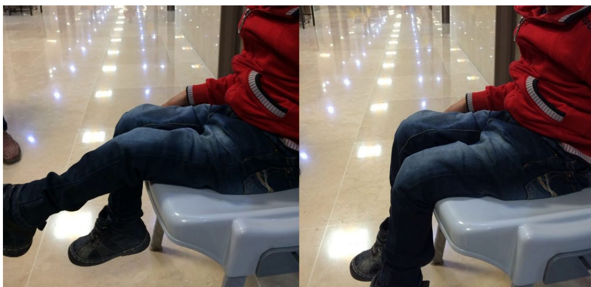
Figure 5. After the knee surgery, the patient's ability to walk and flex the left knee, with 30-degree fixed flexion in extension