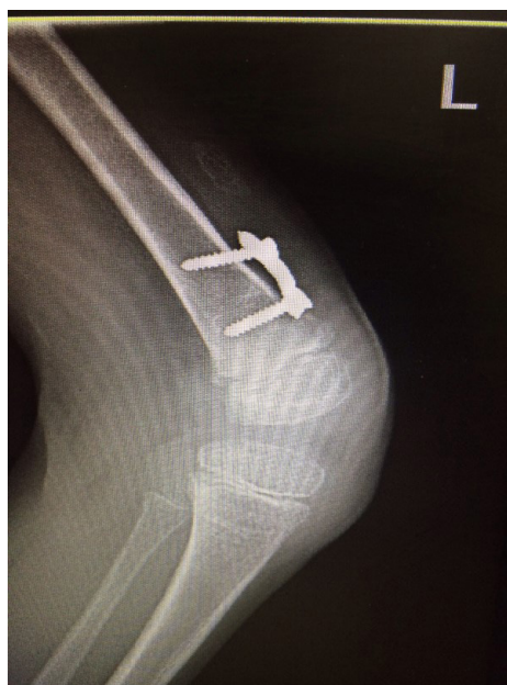
Figure 4. Left knee postoperative radiography

harvested and transferred anteriorly toward the tibial tuberosity. It was secured at the tibial tuberosity by anchor suture and finally attached to the inferior pole of the patella via the patellar tendon, which was detached from the superior capsular part. We were not able to reduce the patella to its normal anatomic position. By the competent quadriceps muscle and patellar tendon, attached now to tibial tubercle via semitendinosus tendon, the patient's extensor function improved considerably. It made the flexion degree residual reduced to 20-30 degrees. Afterward, we performed anterior hemiepiphysiodesis using eight plates in the distal femoral physis. This procedure was intended to correct the residual flexion deformity. In the end, the posterior 3*3 skin defect was grafted with a full-thickness thigh skin