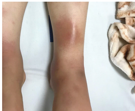
Figure 1. Multiple tender and palpable lesions on the lower limb

Mammary glands and Cooper's ligament were normal. Skin thickness was normal, too. There was no solid or cystic mass, also no acoustic shadow change or calcification, in the normal axillary zone. Her blood test results were the following: white blood cells, 8.3 \times 10^3/\mu\text{L} (neutrophils 73%; lymphocytes 19%); platelets, 196 \times 10^3/\mu\text{L} ; red blood cells, 3.22 \times 10^6/\mu\text{L} ; hemoglobin (HGB): 9.5g/dl; MCV: 88, erythrocyte sedimentation rate: 86; and C-reactive protein: 98