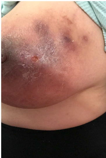
Figure 2. Left breast mastitis

In the second step, because of low hemoglobin count, we requested Iron profile with the following results: Fe/iron: 20g/L, Ferritin: 162ng/mL, Total Iron-binding Capacity (TIBC): 181 \mu g/dL, suggesting anemia due to chronic disease. To evaluate breast changes reported in breast ultrasonography and resistance acute mastitis and to rule out malignancy, we requested biopsy from the left breast with the following report: Breast tissue with a mixed inflammatory reaction, including scattered granuloma formation concentrated in lobules. Ziehl-Neelsen staining was negative. No tumor was seen.