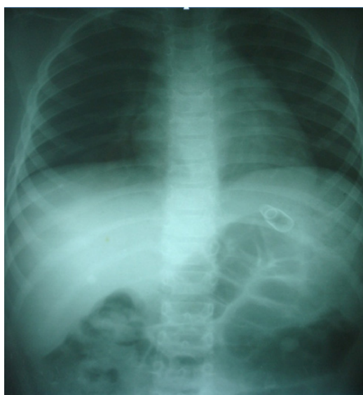
Figure 2. The ampoule in the patient's abdomen

The patient underwent an upper endoscopy, but the object had already passed through the pylorus. The vital signs remained healthy and the patient presented no symptoms. The following day, he passed the ampoule without any complications.