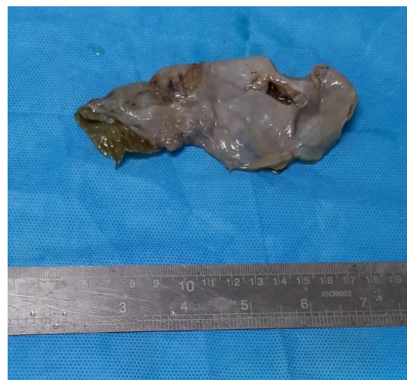
Figure 1. Gross anatomy of the gallbladder. Ill-defined green-brown papillary mass in the fundus