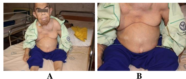
Figure 1. A. Short stature and facial features of the patient; B. Umbilical hernia of his abdomen

On admission, he was intubated and underwent invasive ventilation because of low O 2 saturation, poor respiratory effort, and loss of consciousness. Nasogastric (NG) tube, Foley catheter, and central venous access were fixed for him.