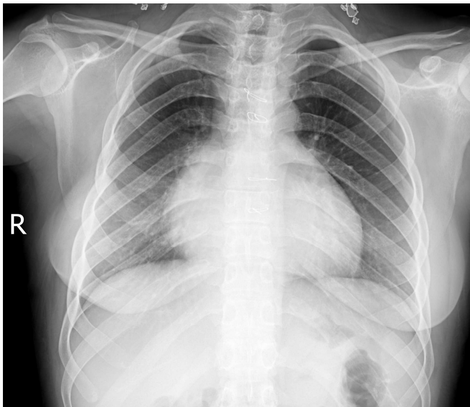
Fig. 1. C.X.R. of the patient.

Maternal transthoracic echocardiography confirmed mild LV enlargement and moderate systolic function. Ejection fraction was 35%, hypoplastic R.V., mild M.R., hypoplastic P.V., Tricuspid atresia, large V.S.D., dilated sinus coronary(1.2cm), large V.S.D. (2.5cm) and thin inter-