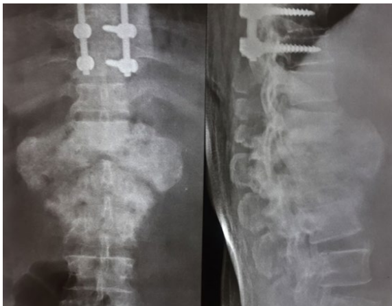
Fig. 1. AP and Lateral view of dorso-lumbar spine showed pseudotumor and hypertrophic ossification from D12-L3 level.

MRI showed destruction of endplates and necrosis at L1& L2 level, and vertebral body was replaced by large area of disorganized paraspinal and intraspinal calcified mass. From T12-L3 vertebrae, lytic areas were seen with involvement of both anterior and posterior column along with soft tissue mass extension. Wagner et al. "6 D's" was seen in the present case scenario and could be observed on the available imaging. [9,10] In the present case scenario, the patient was managed conservatively with bed rest, immobilization and medications for pain relief, as stated in the existing literature.