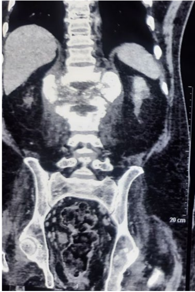
Fig. 3. Coronal section of MRI LUMBO-SACRAL area showing Wagner et al. '6D's'.