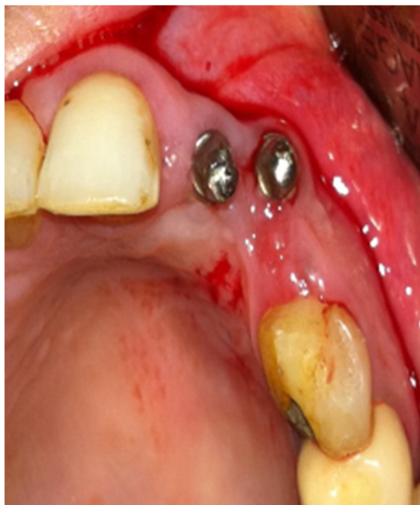
Fig. 1. The malpositioned implants replaced for left maxillary lateral incisor and canine.

In comparison with allograft, xenograft, and alloplastic substances, it is obvious that the valency of induction and formation of autograft osseous as well as immune compatibility makes it the material of choice with more than 95% success rate [1-4]. Without a doubt, the reported confinements of allografts such as the restricted amount of gained bone, few suitable donor areas, and post-operation complications cannot be ignored [4].