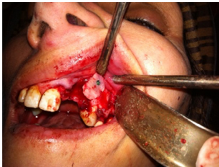
Fig. 3. The prepared block graft fixed by a screw as the buccal wall of the defect.

Optional autogenic donor location was divided into extraoral (cranial vault – iliac crest) and intraoral ones [3] which are chosen based on defects size and kind, rate of progress, and patient statements.[3, 4] Sakkas reported intraoral graft surgery was more acceptable for patients as one surgery was enough to transfer the graft from the donor site to the recipient site with fewer side effects while extraoral graft surgery generally is accompanied by unpredictable resorption[4]. It is notable to mention Faverani who favored the extraoral cranial vault graft believing it would not cause serious complaints unlike iliac crest graft but the needed expertness was the only matter. [3] Consequently, extraoral harvesting is avoided unless a great amount of graft is required [4].