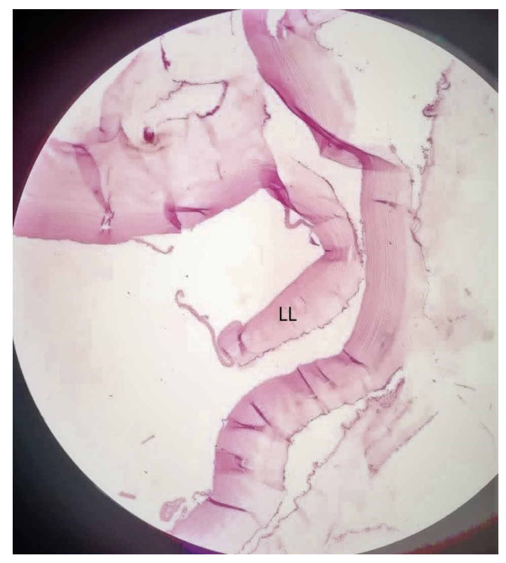
Fig. 4. Periodic acid-Schiff stain, the laminated layer (LL).

The microbiologic culture of the pyogenic cysts yielded positive results for E. coli. The postoperative treatment course included oral Albendazole, along with intravenous Cefepime and Metronidazole. The patient was discharged 11 days after surgery without experiencing any complications.