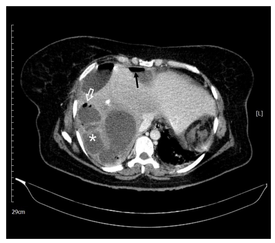
Fig. 2. Infected hydatid cyst with disrupted wall (asterisk), subcapsular collection (black arrow), and gas containing fluid spreading to liver parenchyma (arrow).