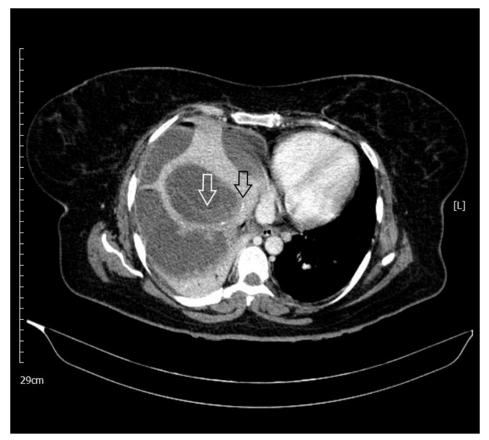
Fig. 1. Hydatid cyst with an internal membrane (white arrow) and calcification foci in the cyst wall (black arrow).

An immediate laparotomy was conducted, which revealed the presence of multiple liver cysts with connecting septa. Total cystectomy and peritoneal lavage were performed. A histopathologic examination of the primary cyst confirmed its identity as a hydatid cyst (Figure 4).