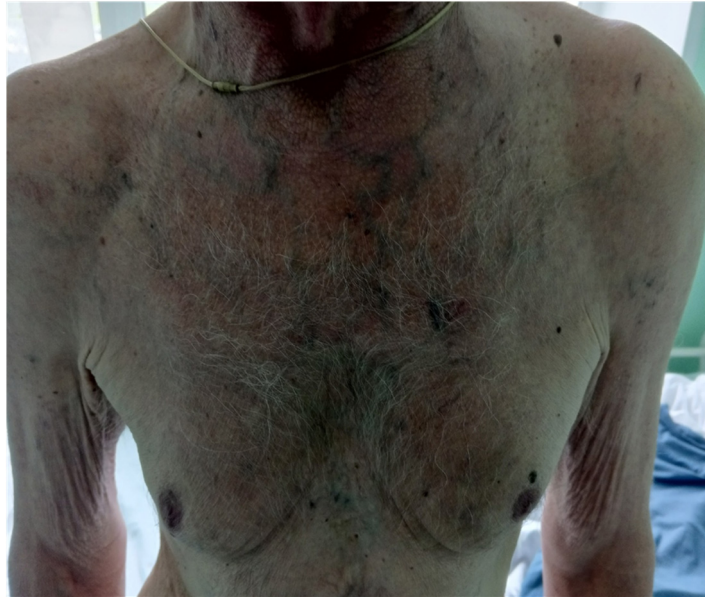
Fig. 2. Engorged blood vessels on the chest.